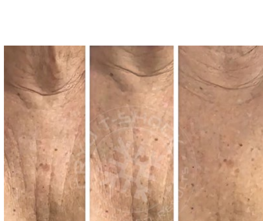
AFTER ONE DECOLLETE TREATMENT