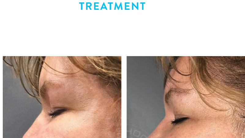
AFTER TWO ANTI-AGING FACIAL TREATMENTS