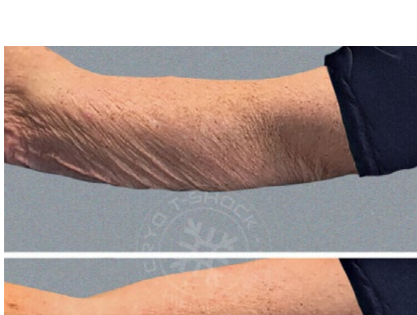
AFTER ONE TISSUE STIMULATION TREATMENT