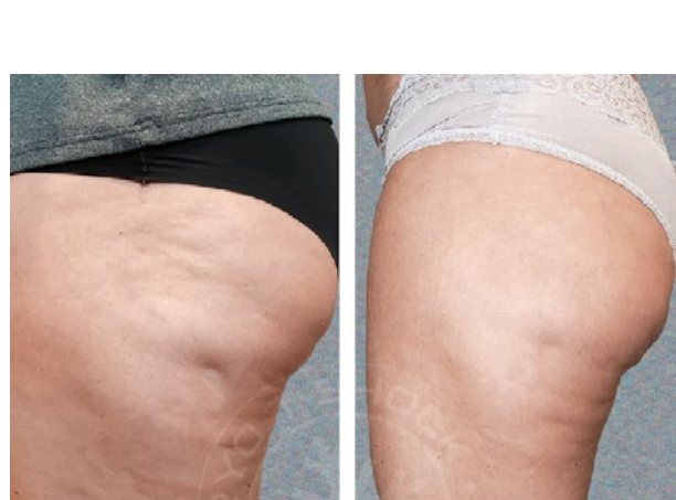
AFTER THREE CELLULITE TREATMENTS