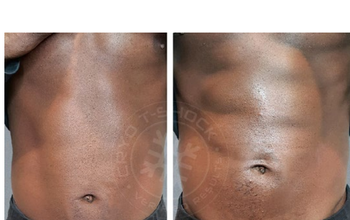
AFTER ONE DEFINITION TREATMENT

T-Shock Slimming may require 5 or more sessions over several months to see the best results. T-Shock Toning results are more immediate and also may require multiple sessions to achieve optimal results.